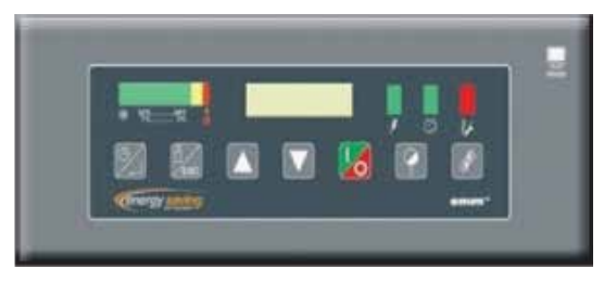
Optional Level II (CRE190-CRE675)